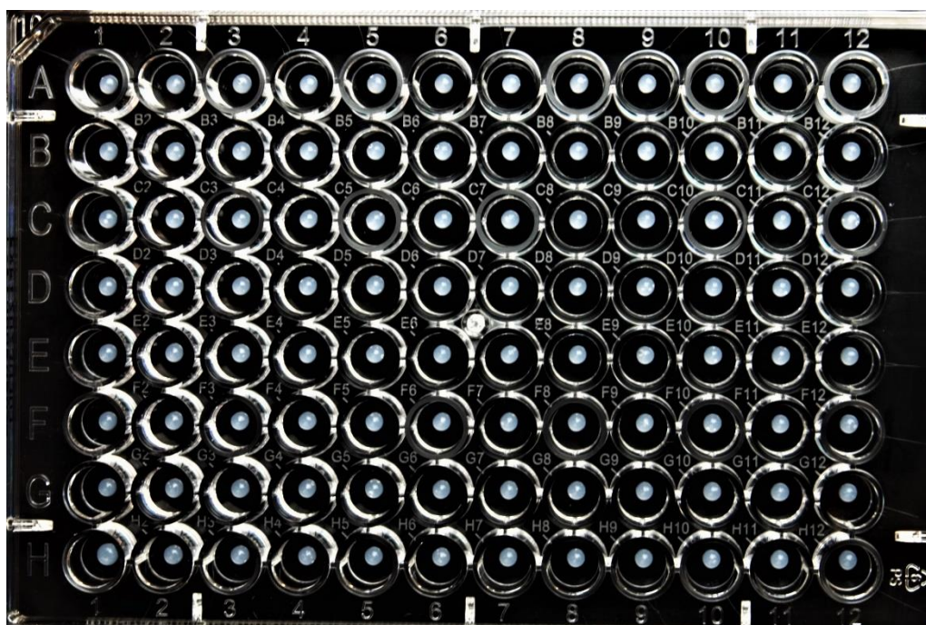
Figure 1. 5 \mu L droplets of CELLINK Bioink mixed with PBS (10:1), simulating bioink dilution with cell suspension, dispensed in a 96-well plate, using parameters in Table 1. The picture was taken prior to ionic crosslinking.